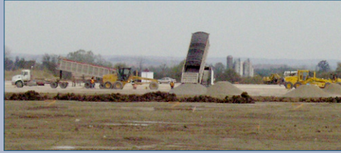
AMB Property Corporation | Vitran Logistics Airport Road, Tullamore www.amb.com

Jones New York is located within a 3,700 sq. ft. commercial unit within the Empire Theatre plaza. Jones New York is one of the brands sold under Jones Apparel Group, Inc. a leader in the apparel and footwear industry, including sportswear, jeanswear, suits, dresses, shoes, accessories and costume jewellery.