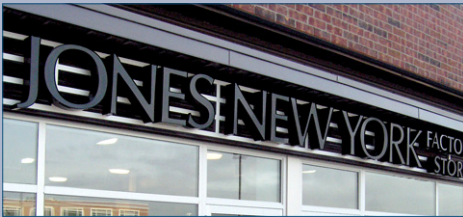
Jones New York 196 McEwan Drive East, Bolton www.jonesnewyork.com

Located in the former TD Canada Trust location, the restaurant features a 76-seat outdoor patio and a private party room for up to 24 guests. Working as a franchise operation since 2001, the restaurant concept has expanded to 23 locations across Ontario, becoming one of the fastest-growing franchises in Canada.