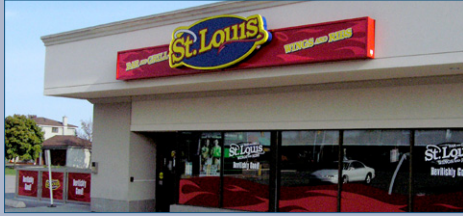
St. Louis Bar & Grill 301 Queen Street South, Bolton www.stlouisswings.com

Located in the former TD Canada Trust location, the restaurant features a 76-seat outdoor patio and a private party room for up to 24 guests. Working as a franchise operation since 2001, the restaurant concept has expanded to 23 locations across Ontario, becoming one of the fastest-growing franchises in Canada.