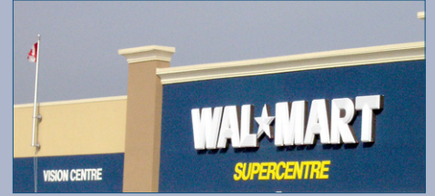
Wal-Mart 150 McEwan Drive East, Bolton www.walmart.ca

On September 19, 2007 Wal-Mart Canada officially opened nine new supercentres in Canada – one of which was the newly expanded Bolton location. The new expansion adds an additional 50,000 sq. ft to the existing 110,000 sq. ft. The Supercentres have approximately 30% more sales floor than traditional Canadian Wal-Mart stores. Each Supercentre represents an investment of more than $20 million, 200 trade and construction jobs, and as many as 500 jobs for in-store associates.